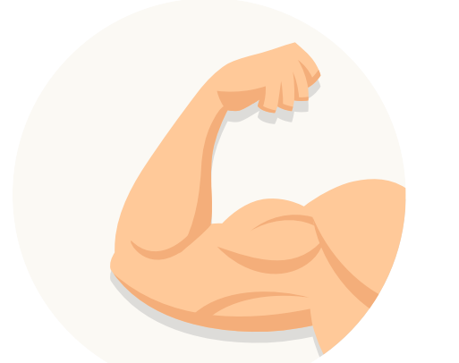
Create an Independent Learner